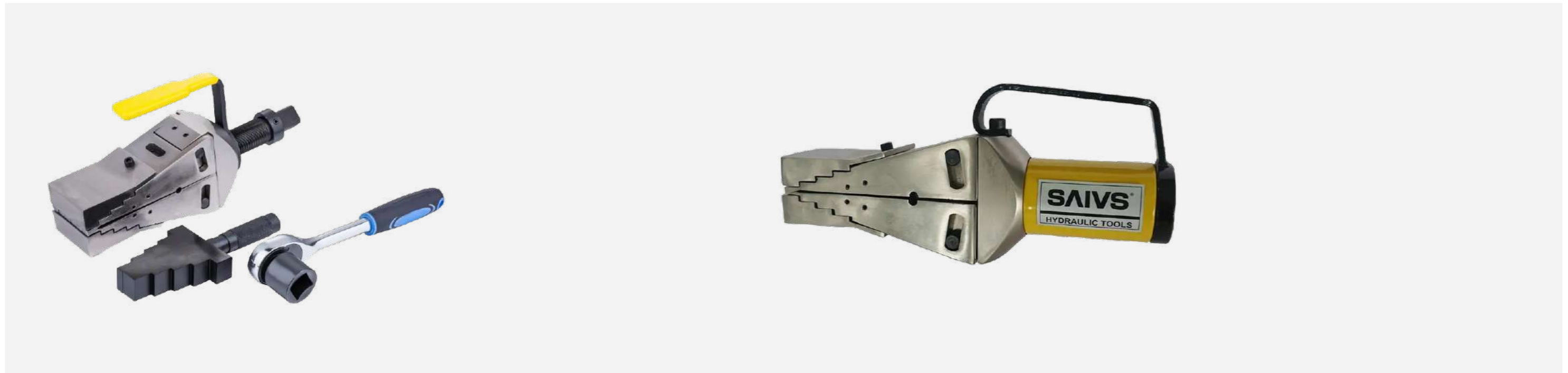
FSM8, 8 Ton 3.16 inch/80 mm Hydraulic Industrial Spreader